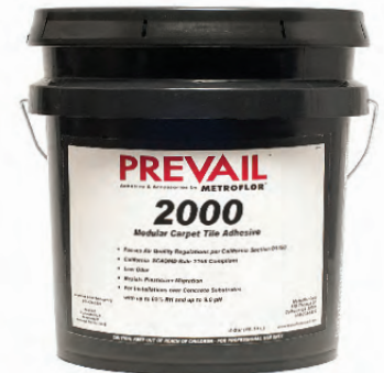
Item Numbers: PR-2000-1G (1 Gallon) PR-2000-4G (4 Gallon)