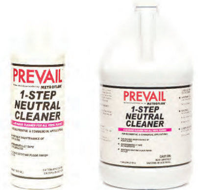
Item Numbers: PR-VICL-QT (1 Quart) PR-VICL-GL (1 Gallon)

Product Compatibility: Suitable for use on all luxury resilient tile and plank by Metroflor® Corp.