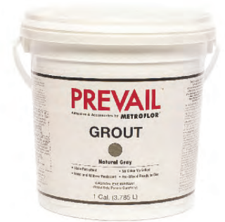
Item Numbers: Listed Individually

Product Compatibility: Suitable for use on all groutable luxury resilient tile by Metroflor ® Corp.