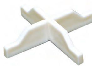
Not shown actual size.

Product Compatibility: Suitable for use with all groutable luxury resilient tile by Metroflor ® Corp.