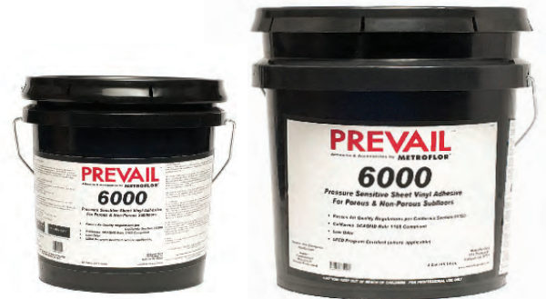
Item Numbers: PR-6000-1G (1 Gallon) PR-6000-4G (4 Gallon)

Product Compatibility: Metroflor®, Artistek®