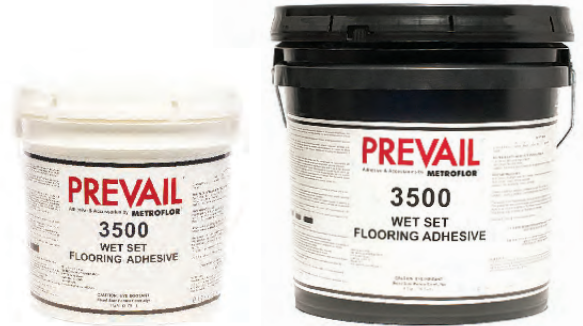
Item Numbers: PR-3500-1G (1 Gallon) PR-3500-4G (4 Gallon)

Product Compatibility: Metroflor®, Artistek®