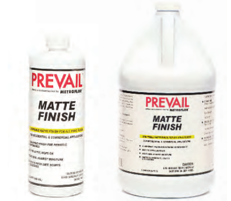
Item Numbers: PR-MAFN-QT (1 Quart) PR-MAFN-GL (1 Gallon)

Product Compatibility: Suitable for use on all ungrouted luxury resilient tile and plank by Metroflor® Corp.