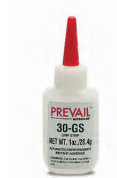
Item Number: PR-30-GS

Product Compatibility: Konecto®, Engage®, Aspire®, Starloc®