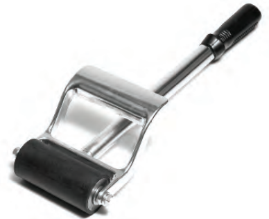
Item Number: PR-Grip-Strip Roller

Compatibility: Konecto®, Starloc®, Aspire®