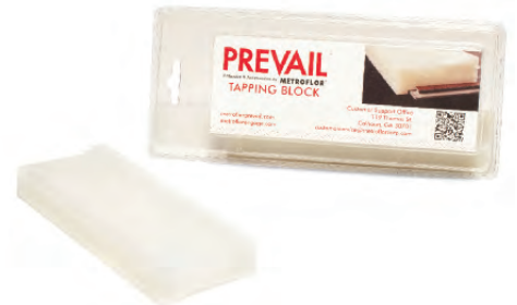
Item Number: PR-TPBK

Compatibility: Engage®, Metroflor® Hybrid, Metroflor® Hybrid Plus