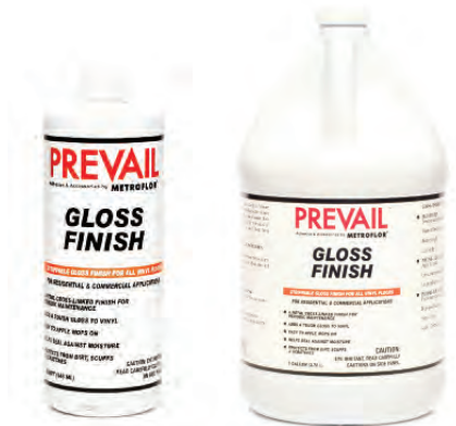
Item Numbers: PR-GLFN-QT (1 Quart) PR-GLFN-GL (1 Gallon)

Product Compatibility: Suitable for use on all ungrouted luxury resilient tile and plank by Metroflor® Corp.