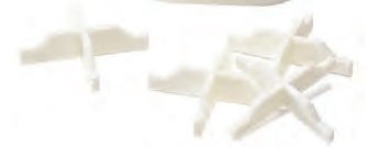
Item Number: PR-SPCR