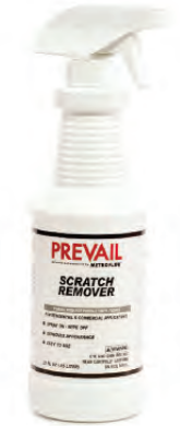
Item Number: PR-KSR-22

Product Compatibility: Suitable for use on all luxury resilient tile and plank by Metroflor® Corp.