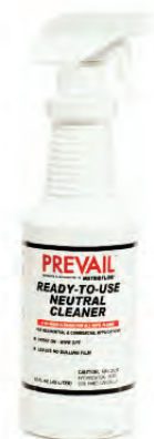
Item Number: PR-RTU-22

Product Compatibility: Suitable for use on all luxury resilient tile and plank by Metroflor® Corp.