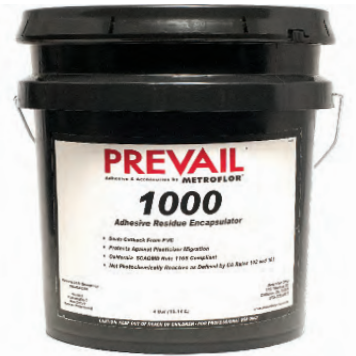
Item Number: PR-1000-4G