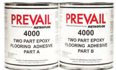
Item Number: PR-4000

Product Compatibility: Metroflor®, Artistek®