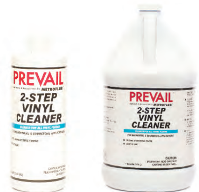
Item Numbers: PR-KOCL-QT (1 Quart) PR-KOCL-GL (1 Gallon)

Product Compatibility: Suitable for use on all luxury resilient tile and plank by Metroflor® Corp.