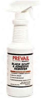
Item Number: PR-BSAR-22

Product Compatibility: Suitable for use on all luxury resilient tile and plank by Metroflor® Corp.