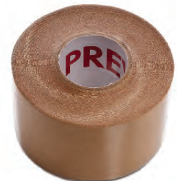
Item Numbers: PR-350 PR-350mini