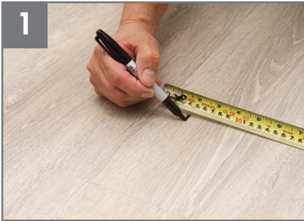
1 Measure 1-1/2" inside the perimeter of the damaged plank, and mark.