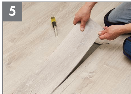
5 Remove the center section, using a small chisel to lift the first edge.