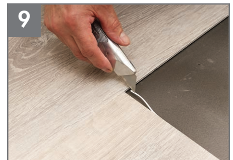
9 Remove the exposed Unifit™ Locking Strip from the floor.