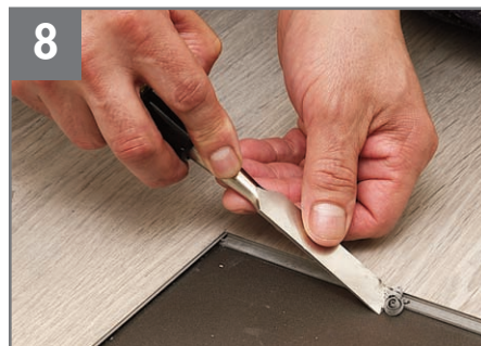
8 Remove the lock from the long and short edges of the surrounding material with a small chisel. Vacuum debris.