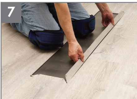
7 Remove the remaining strips of material from the long and short edges.