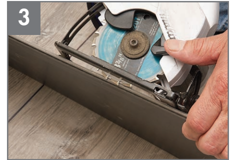
3 Use a plank as a gauge to set the saw blade to the proper depth to avoid cutting through the subfloor.