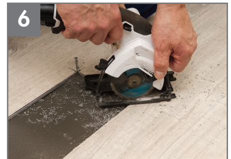
6 Carefully cut the diagonals. Vacuum debris.