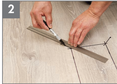
2 Mark diagonal stopping points on the four corners of the damaged plank.