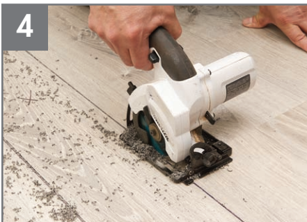
4 Carefully cut along the perimeter marks you made. Vacuum debris.